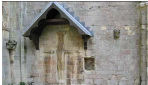
The unique Saxon Rood in the South Garth

The vision of the Friends is ‘to bring together all those who love the Abbey and wish to support its life, work and ministry in the community’.