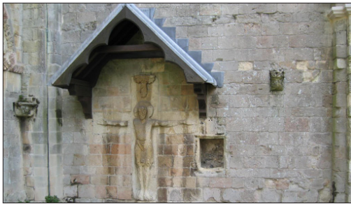
The unique Saxon Rood in the South Garth

The vision of the Friends is ‘to bring together all those who love the Abbey and wish to support its life, work and ministry in the community’.