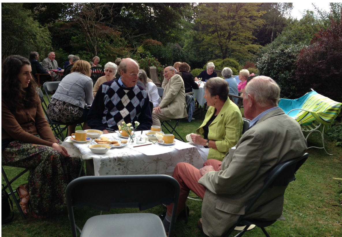
Strawberry Tea 2014