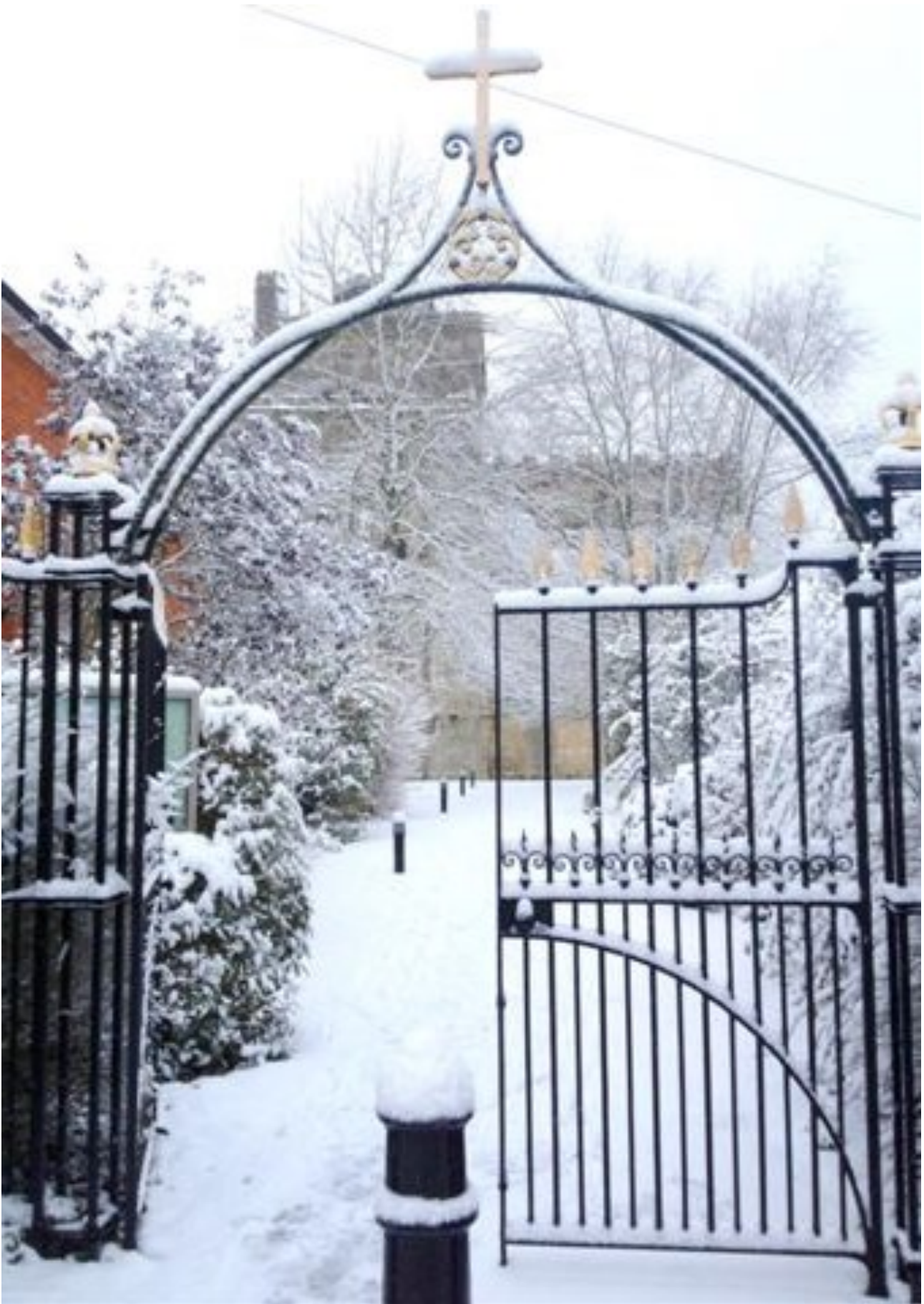
The Garth gate.