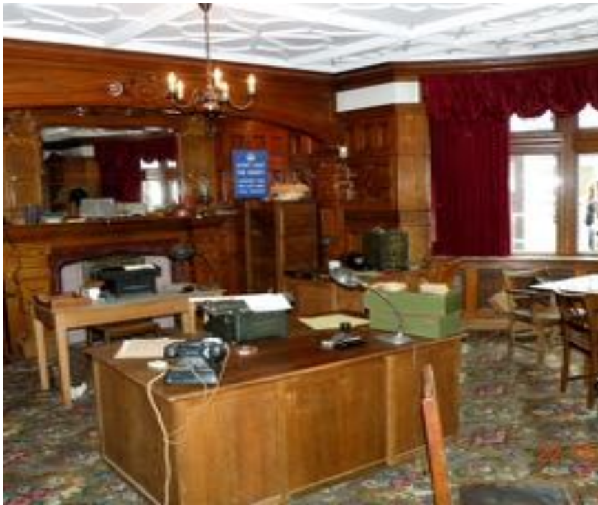
World War 2 offices at Bletchley Park

to make a lively 'sprint' between the various Huts! The afternoon drew to a close with even heavier storms, resulting in a rush to the tea rooms followed by a fast and comfortable trip home to Romsey.