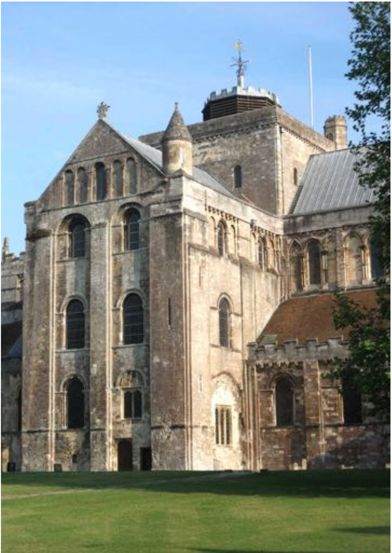
A mid-summer view of the north transept and tower, when the late evening sun reaches this side of the building.