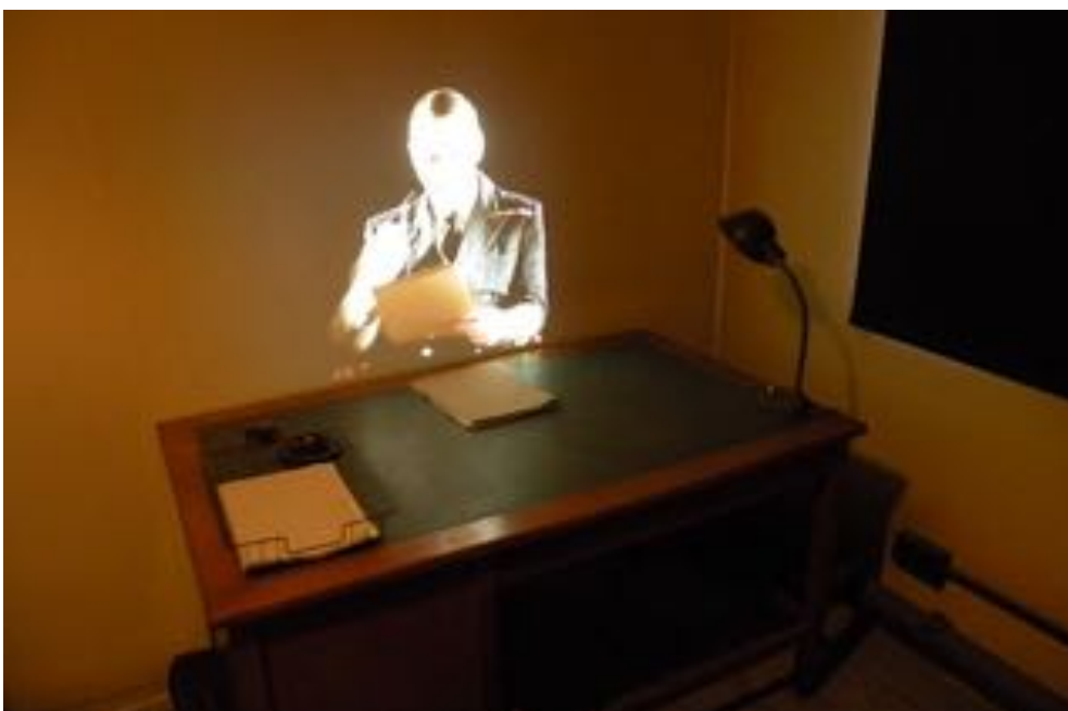
Hut 14 at Bletchley Park

Ultimately 10,000 staff were employed at the site as the work grew in importance. The Friends were able to view much of this activity in the various Huts and the Museum, which contained original Enigma and Lorenz cipher machines. The weather can always be counted upon to make Friends trips varied and this trip did not disappoint. Thunder, lightning and torrential rain combined