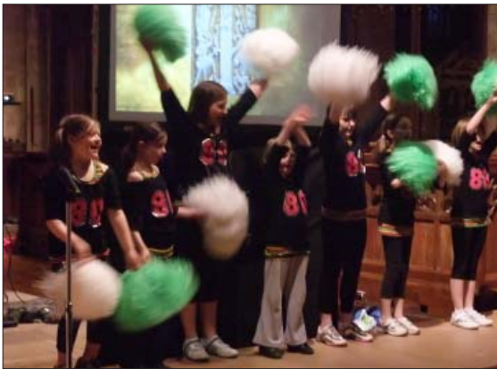
Cheer-leaders from The Abbey School gave a stunning performance