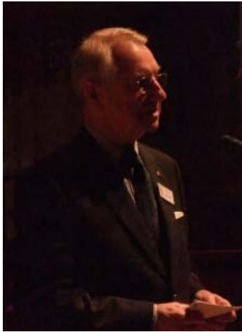
Speeches from the Chairman (above) and President (right) during the Launch