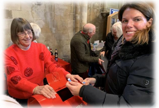
Bottle Tombola at Abbey Christmas Fair