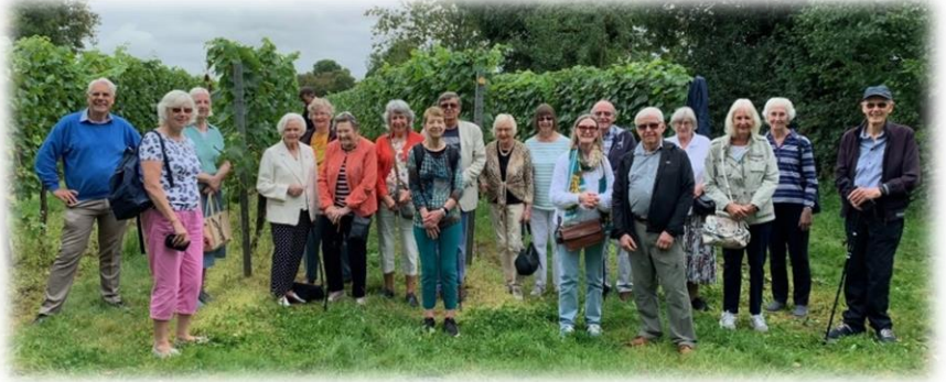
Raimes Family Vineyard and nearby Hinton Ampner House