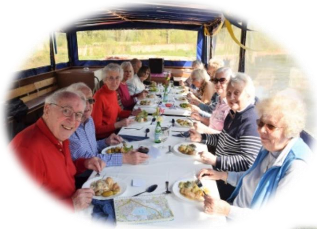
Cruising on the Thames