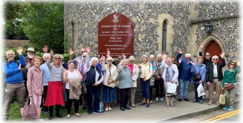
Visit to Arundel Castle and Gardens

AGM with a lovely Strawberry Tea – how better to carry out the formalities than with a Strawberry tea. See pages 3 and 4 for news of the 2024 AGM!