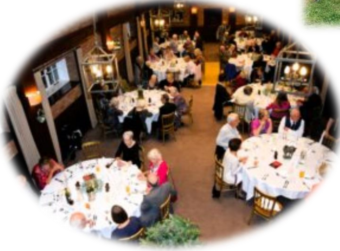
Annual Dinner at the White Horse