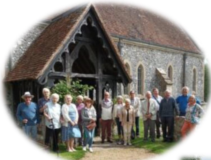
Tour of four Churches in the Avon Valley