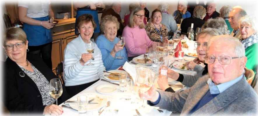
'High Society' at The Mill at Sonning