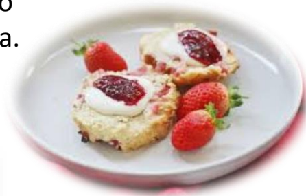
Stourhead & Brush Factory trip

AGM with a lovely Strawberry Tea – how better to carry out the formalities than with a Strawberry tea. See pages 3 and 4 for news of the 2024 AGM!